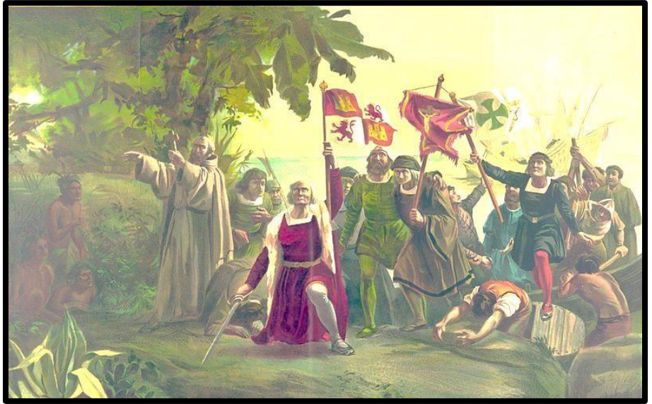
Image Source: Public Domain, Library of Congress, First landing of Columbus on the shores of the New World, at San Salvador, W.I., Oct. 12th 1492 , Dióscoro Teófilo Puebla Tolín

Read pages 28-29. Ensure you understand the varying ways to analyze a document. When you have finished, analyze the image below.